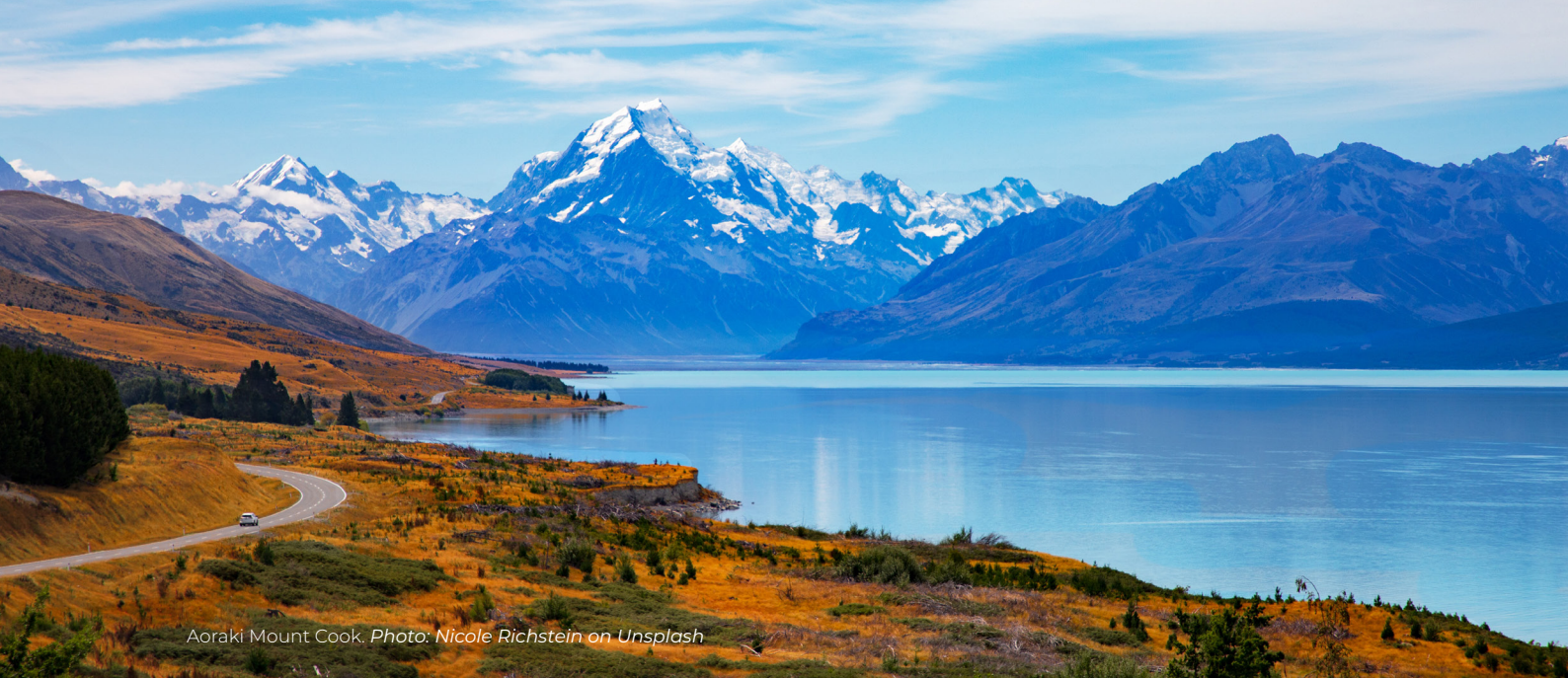
Aoraki Mount Cook.