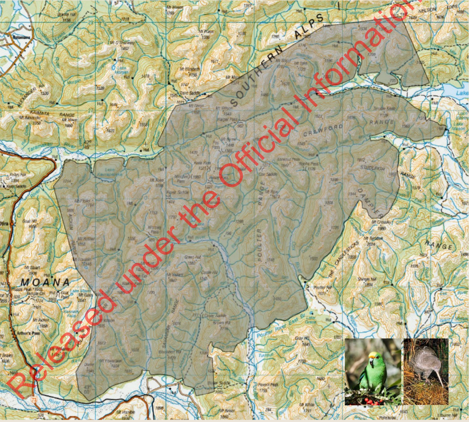
Proposed aerial 1080 treatment area covering parts of Arthur's Pass National Park, Lake Sumner Forest Park and Otira-kopara Conservation Area. Department of Conservation

Where heavy seedfall occurs, we can expect predator numbers to soar. To be ready to protect at risk native species, DOC is planning predator control at these sites.