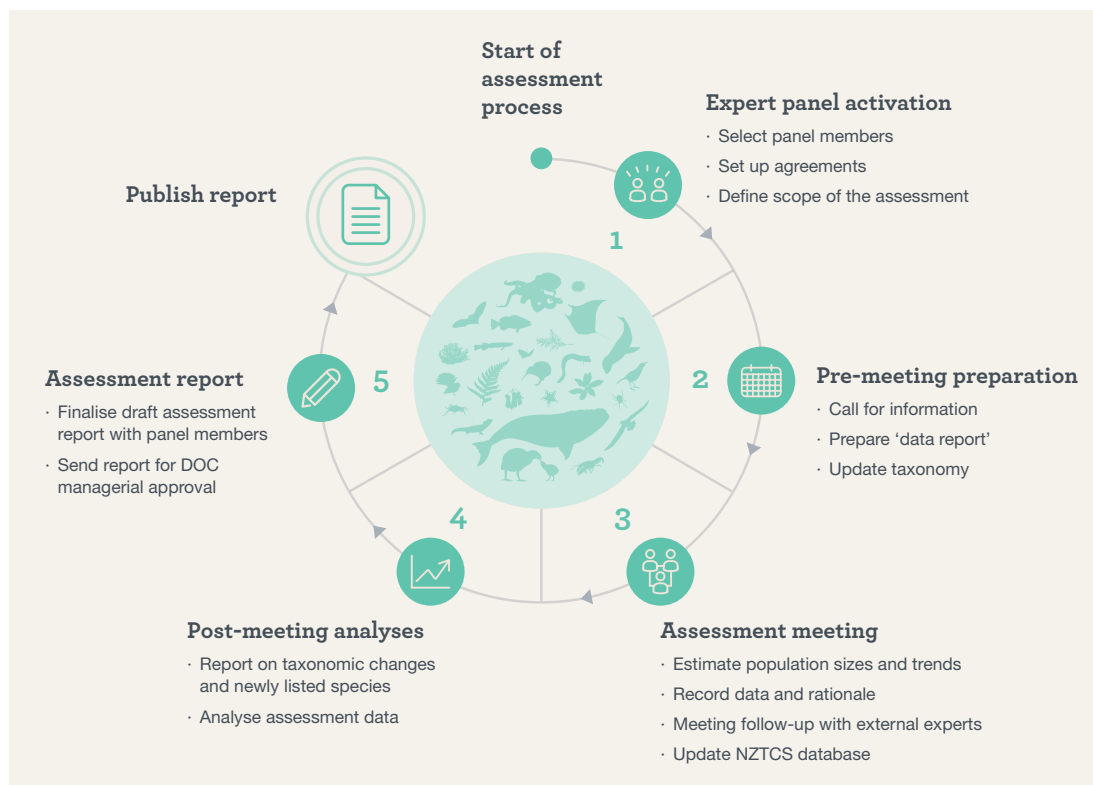
Figure 1. Graphic representation of the Department of Conservation's (DOC's) New Zealand Threat Classification System (NZTCS) process summarising the list of actions within each of the five phases.