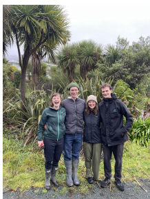
Location: Toi Toi Nelson