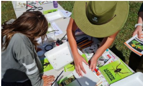
Location: Momorangi Campground