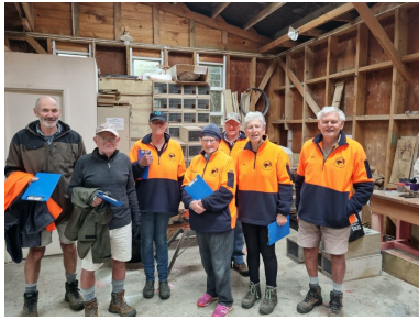
Location: Saint Arnaud Village