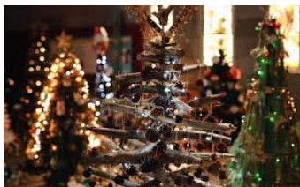
Location: Millers Acre, Nelson