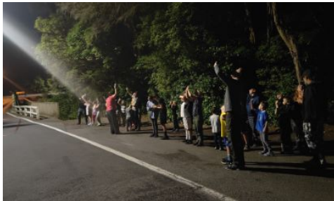
Location: Pelorus Bridge Carpark