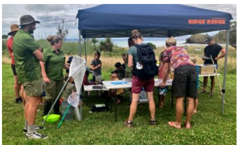
Location: Whites Bay