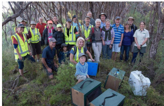
Location: Abel Tasman National Park