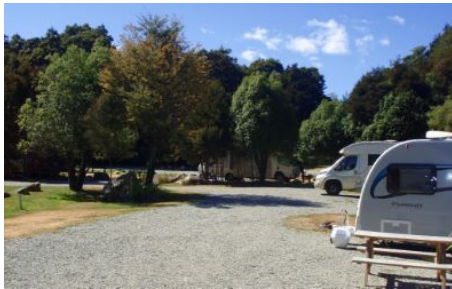
Location: Nelson Lakes National Park