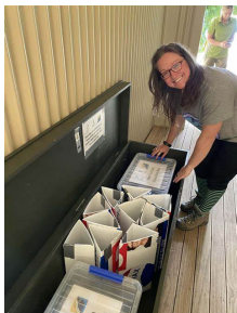
Location: Abel Tasman National Park