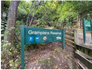
Location: Grampians Reserve, Nelson