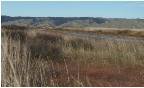
Location: Kotuku Walkway, Blenheim