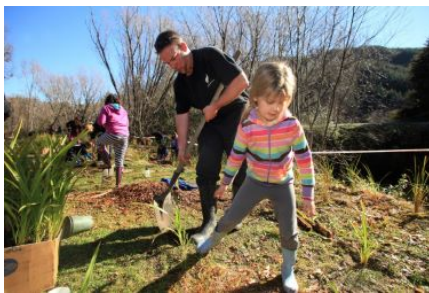
Location: Maitai River, Nelson