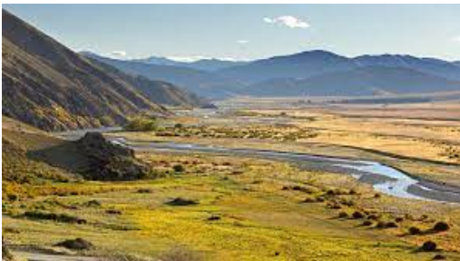
Location: Molesworth Recreation Reserve