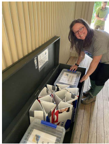
Location: Abel Tasman National Park