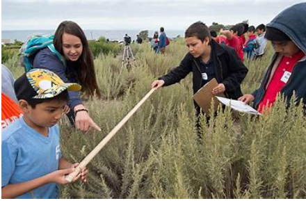
Location: Free Online Training Courses