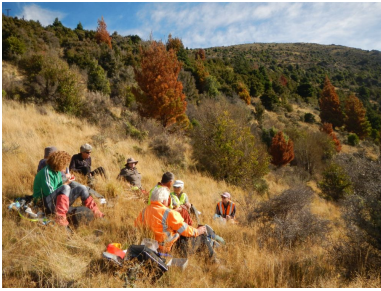
Location: South Marlborough