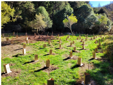
Location: Renwick Nursery