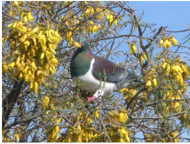
Location: Kellys Conservation Forest, Enner Glynn