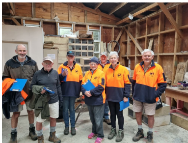
Location: Saint Arnaud Village