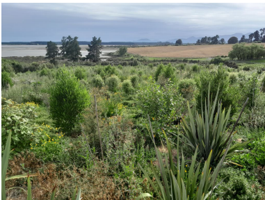
Location: Research Orchard Rd, Appleby