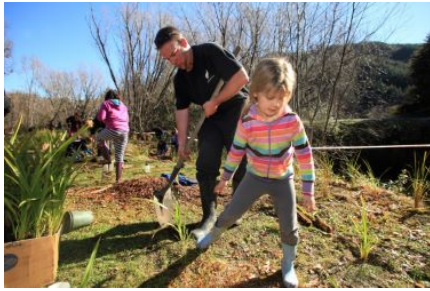
Location: Maitai River, Nelson