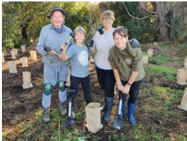
Location: Rarangi, Marlborough