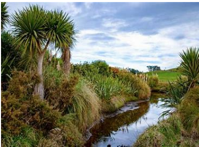
Location: Free Online Training Courses