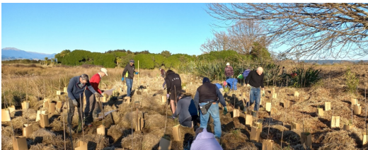
Location: Waimea Estuary, Tasman