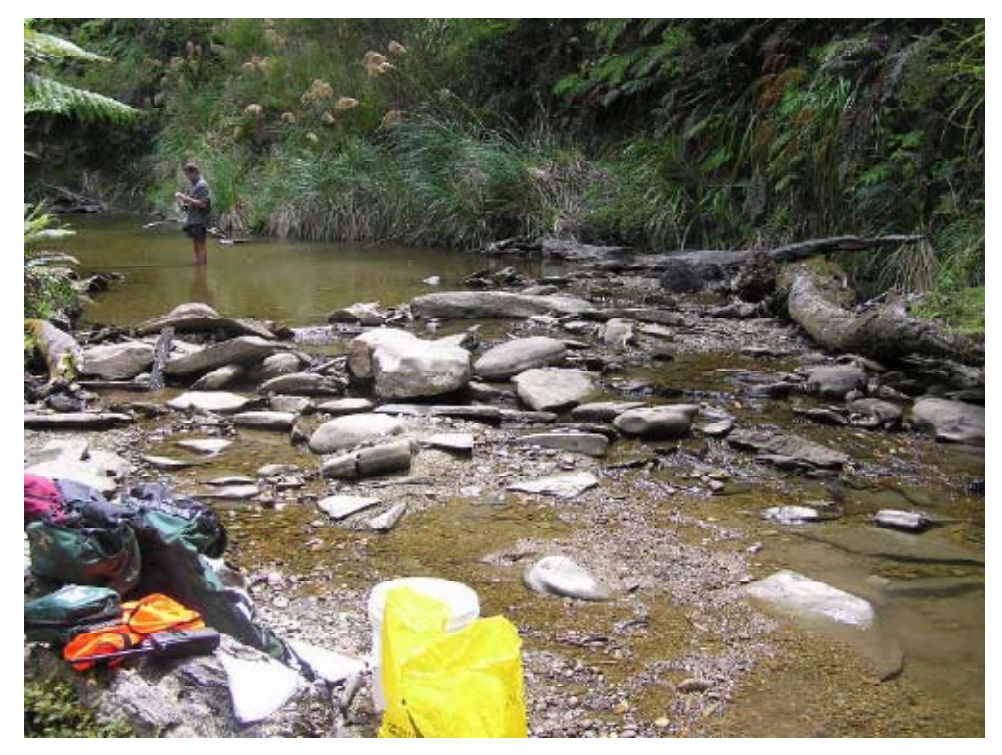
FIGURE 3: THE SAMPLED RIFFLE IN THE OMARU STREAM.