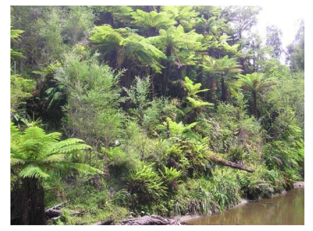
FIGURE 2: RIPARIAN VEGETATION AT THE SAMPLING SITE IN THE OMARU STREAM.