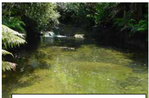
Swimming and Water Hole