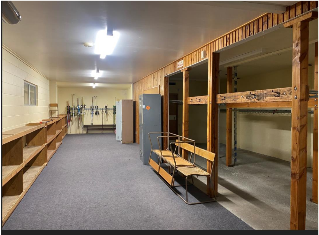
F. Interior: Lower ski gear storage area