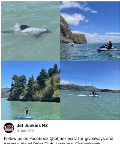
S Jan 2021 Follow us on Facebook @jetjunkiesnz for giveaways and promos. Naval Point Club, Lyttelton, Christchurch. Jet ski Tours/Hire, Kayak and Paddleboard Hire www.jetjunkies.co.nz to book 1 share

4. A final concern contrary to the Department of Conservations legislation is they have already advertised Hector's dolphins on their social media platforms<sup>4</sup>. "...viewing of marine mammals as a side activity of a trip (eg fishing charter, guided kayak tours, guided walking tours) will still need a permit if the above criteria are met. Any advertising of marine mammal encounters on a website or social media is seen as a purpose as potential customers are led to believe they may be able to view marine mammals on a trip". Please see below for a screen shot from their Facebook page. If they are already breaking rules, what more will they do in the future?