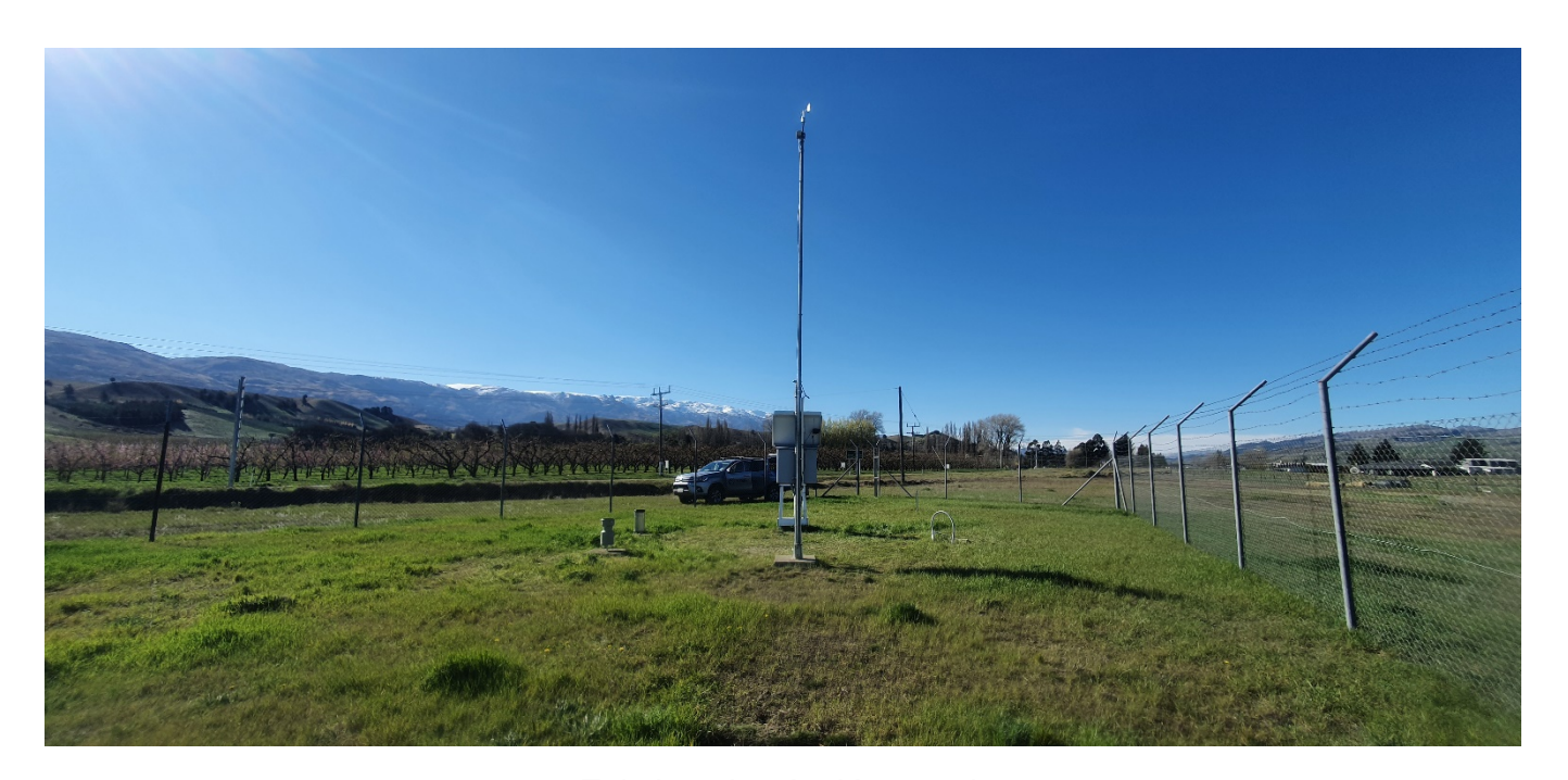
Existing view looking north