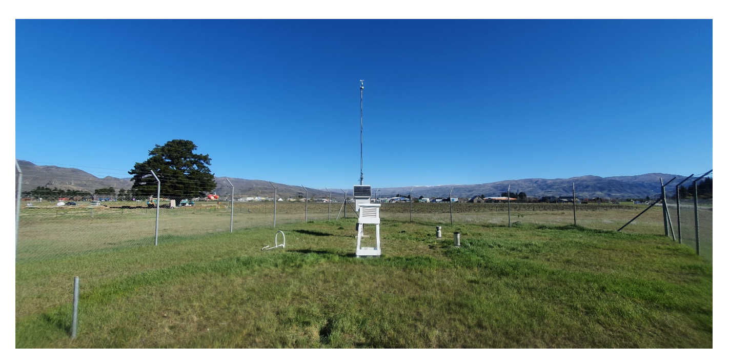
Existing view looking south