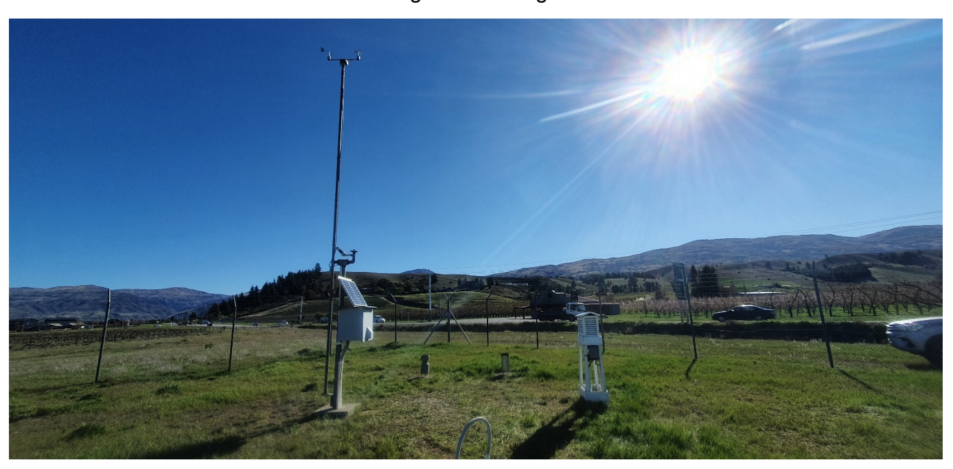
Existing view looking west