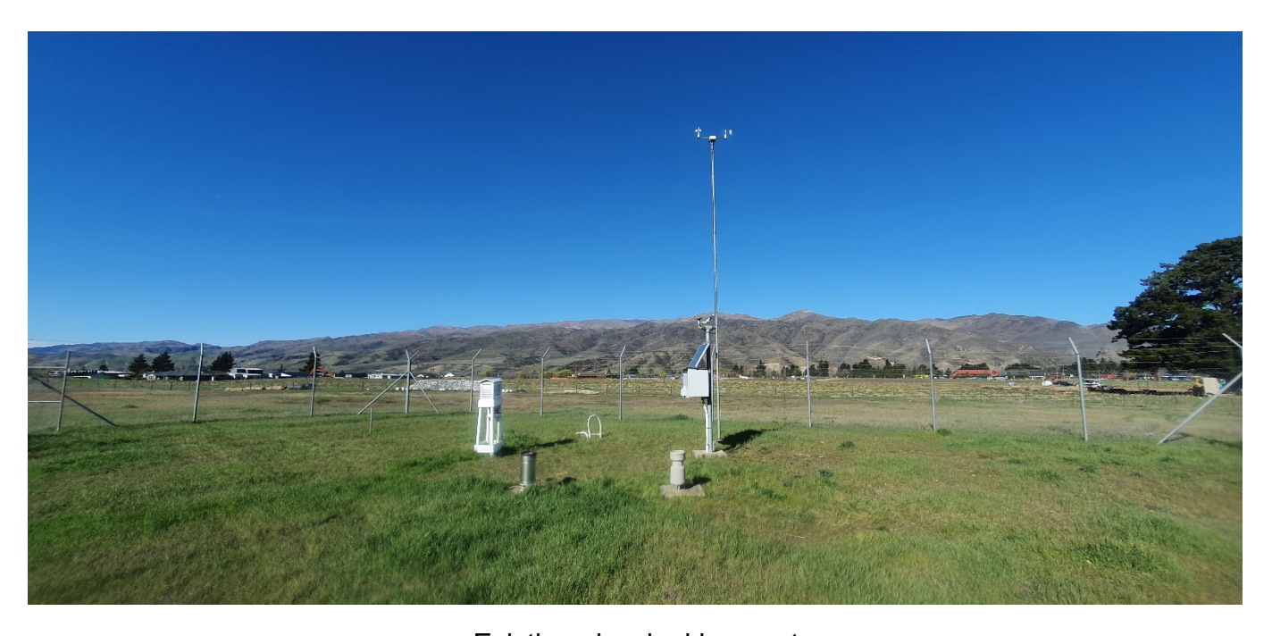
Existing view looking east