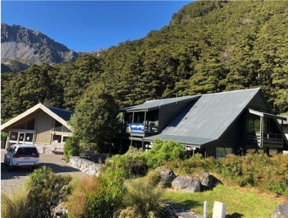
Photo 1 – Building under application is the retail/office/equipment store building on the right (AGL building). Landscaping around the building is evident.