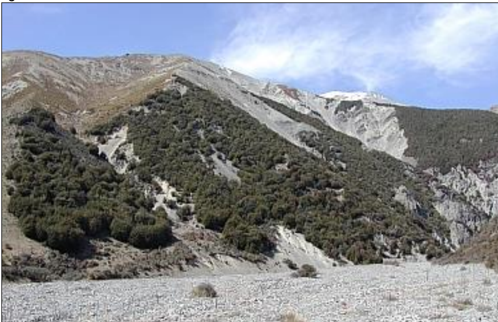
Photo 3: Closer view of mountain beech forest on Castle Hill Peak above Ghost Creek