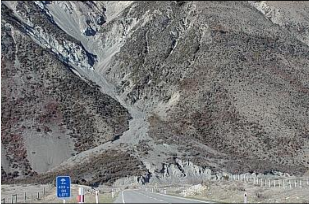
Photo 4: A large scree washout fan at the bottom Mt Plenty from SH73