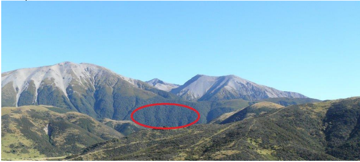
Photo 8: Eastern Torlesse Range slope with highlighted area of mountain beech forest area within existing park to which an additional small area of contiguous forest is to become part of the park