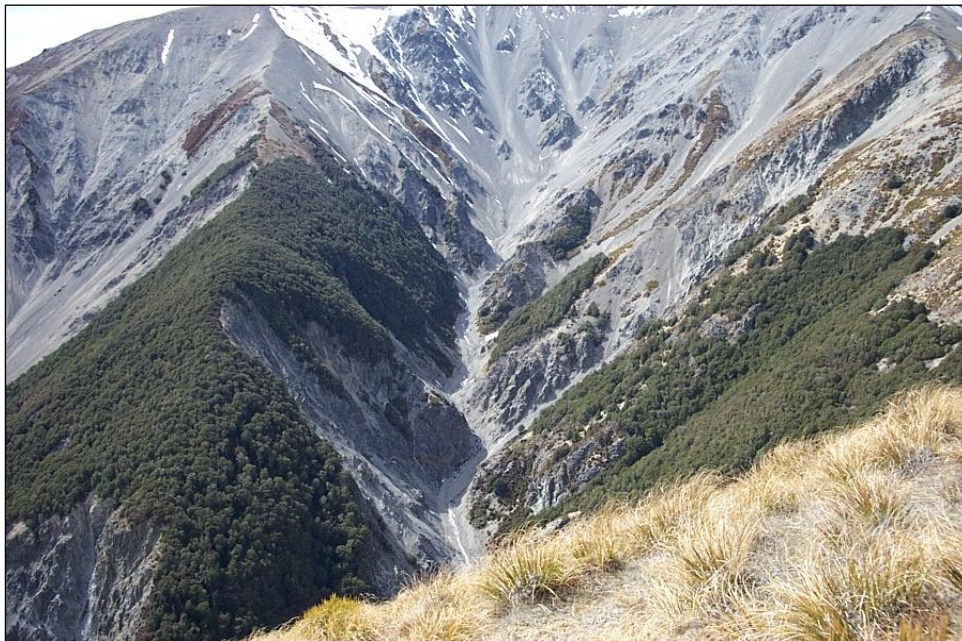
Photo 5: Mountain beech forest, rockland and scree on steep slopes of the Torlesse Range