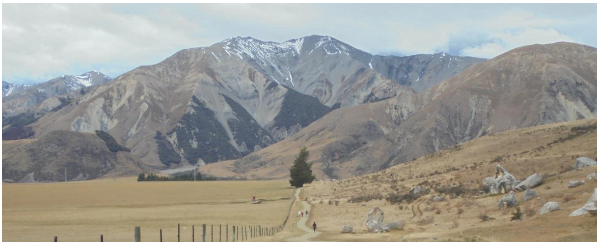
Photo 2: View from Kura Tawhiti Access Track of Castle Hill Peak in distance with areas of mountain beech forest on lower slopes. Tussock-grasslands on Mt Plenty shown on upper right.