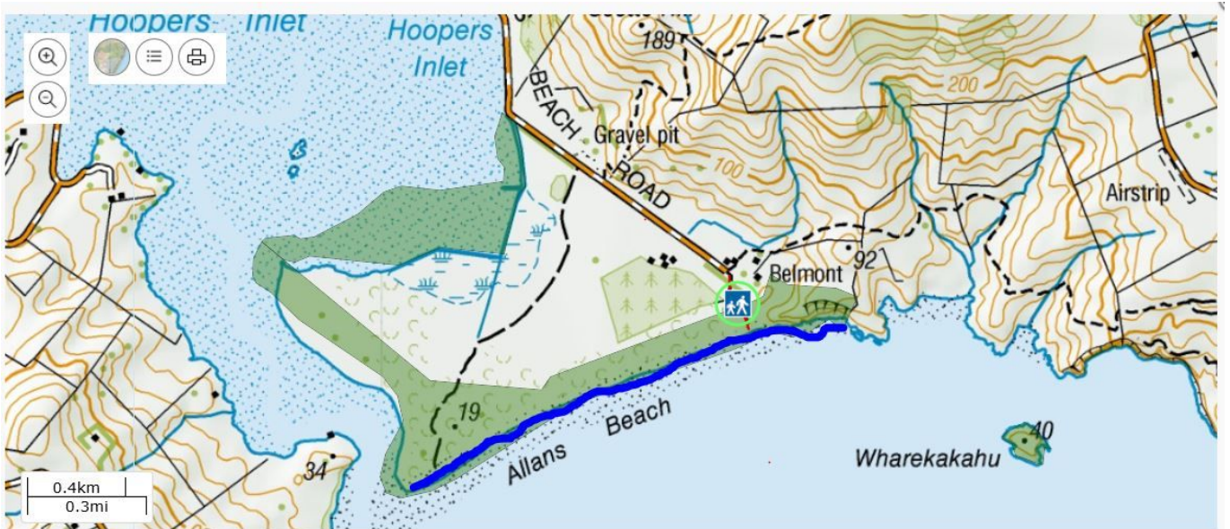
Key: Blue = Beach/route to view mammals. Green shaded area is Public Conservation Area.